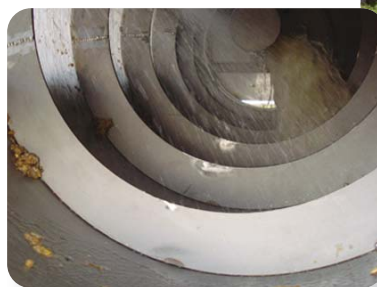
Full cylinder dewatering flights

These units incorporate unique operating and maintenance features. Without removing the full screen covers or screen cylinder, the trunnions, spray bar and brush can be easily accessed via individual maintenance covers. Two more access points act as observation ports that enable plant personnel to monitor cylinder operation and discharge.