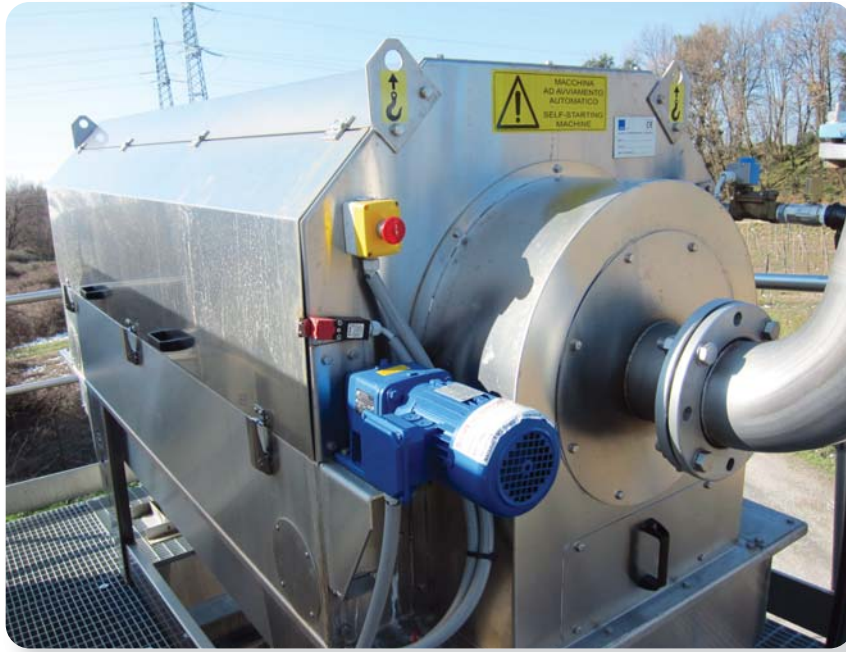
A RotoDrum Screen Pre-treating Wastewater at an MBR Installation.