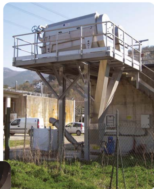
Two Flo-RotoDrum screens discharging to a Flo-WashPress.