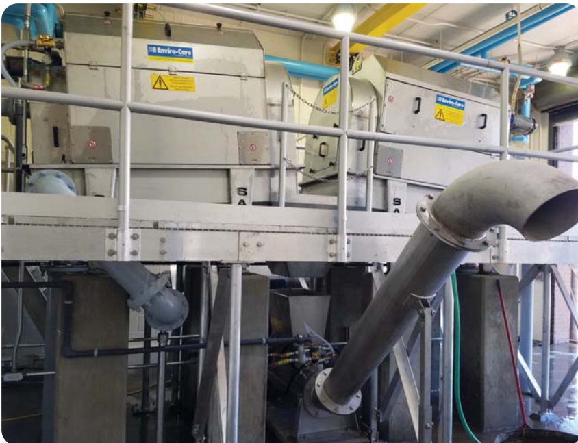
Advanced Design Features for Reliable Screening

The Enviro-Care internally-fed rotating drum screen has been engineered to provide high performance screening and low maintenance. The Flo-RotoDrum screen has no running seals. This is an important feature because seal wear that can cause bypassing is eliminated.